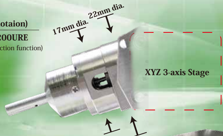
XYZ 3-axis Stage