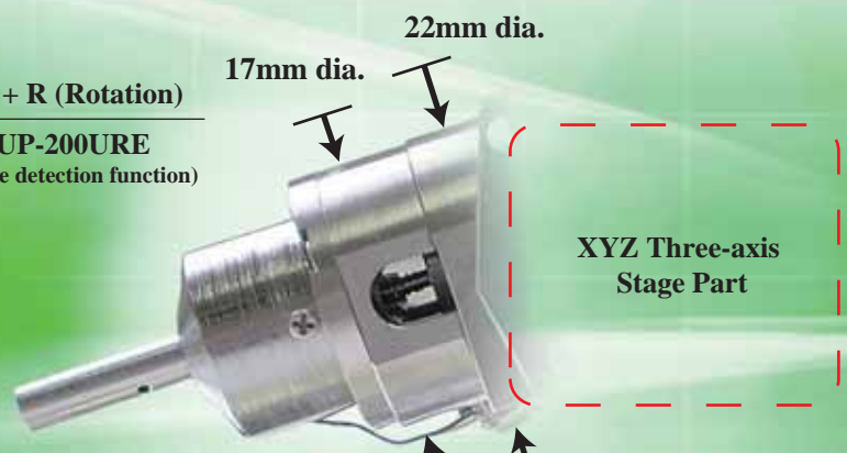
XYZ Three-axis Stage Part